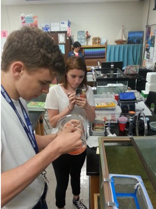
Trout eggs delivered to Union High Classroom

FREE DOOR PRIZES and the raffle prize for the September 15th meeting will be a complete Angler Fly Rod Outfit from L.L. Bean. Bring a $5 or $10 donation for the raffle and you could take this great fly fishing package home with you!