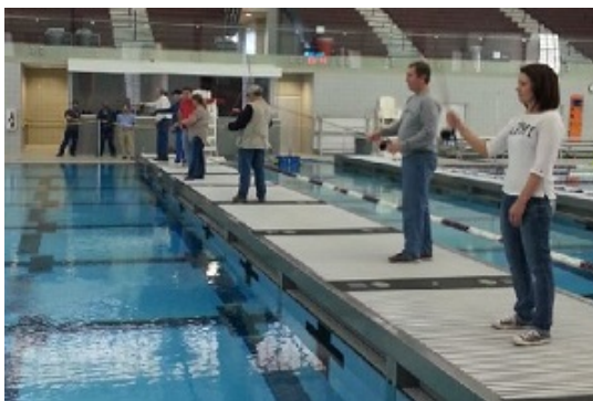
Fly fishing clinic offered at Jenks High School Aquatics Center

A significant amount of the proceeds you pay go to Oklahoma Trout Unlimited for various other programs they offer.