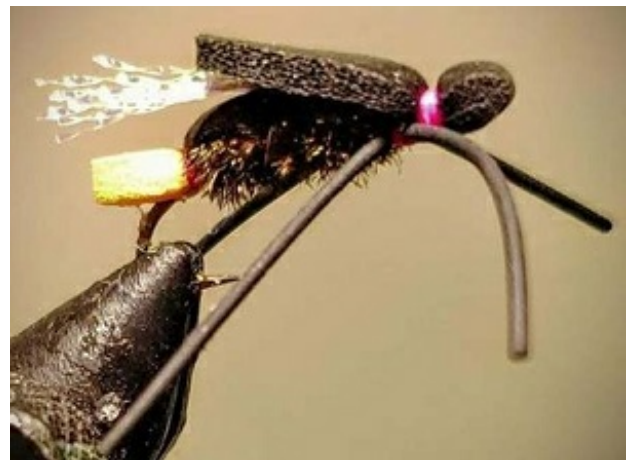
Kelly Brown's first place 'Orange Butt'

We have winners! The October Terrestrials contest has been completed and judged.(see below) . The following have been awarded with top finish recognitions by their peers.