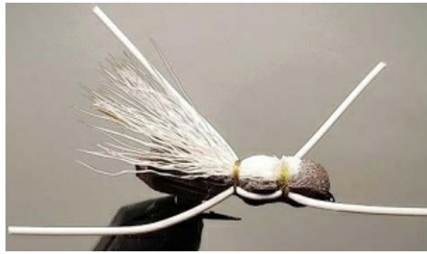
Phil Curtis' third place 'Deer Wing Spider'

The Blue flows down an ancient granite uplift that starts a little south of Ada Oklahoma. There are no dams on the 130 miles of the Blue River and the headwaters are entirely prairie and woodlands. The