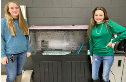
Beggs School Tank

The next phase gets a little more difficult. When the tanks are left unattended over the holidays plenty can go wrong. Plus, feeding has begun and with the feeding of the little fingerling comes the pollution. Things can happen fast. Spikes in nutrient levels that are not dealt with right away can cause a spike in ammonia gases and as we all know; it is poisonous even in small doses.