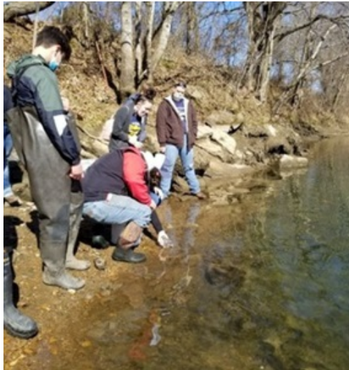
Trout Fingerling Release at the LIR

Our next challenges begin at the end of February when schools and classes line-up to take their field trips to the lower Illinois River to release their fingerlings.