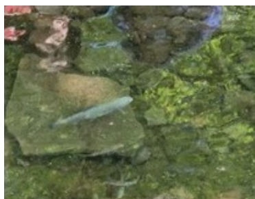
7.5 inch Fingerling

The biggest surprise of the year; I've seen some large fingerlings over the course of these past 10 years... 2 inches, some 3 ... but NEVER have I witnessed a 7.5-inch trout that was raised at Union High School. The students noted that she, these fingerlings are all sterile females, was consuming from 2 to 5 of her sisters a week. Had they had her in the tank another couple of weeks the 12 remaining "survivors" would have most likely also been consumed. Talk about a learning experience! The students couldn't stop talking about her most of the day... and I'd bet many will remember their TIC program for years to come.