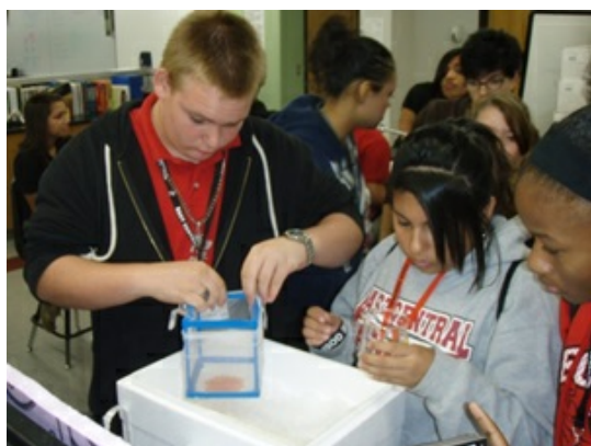
East Central HS students prepare egg basket and count eggs

At the beginning of each school year each teacher begins to prepare their individual tanks and their students for the arrival of the trout eggs. These eggs come from The Trout Lodge in Washington and are the trout species rainbow/ Kamloops. The eggs are set to arrive on Thursday Oct. 31 st and at that time volunteer "tank leaders" will come to my office and patiently wait for FEDEX to arrive with the eggs. We will then divide up 5,000 eggs into equal portions. Once that's done the leaders will scramble to each school where teachers and students anxiously await their arrival.